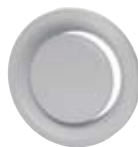
BOC/BOR Interior Air Valve